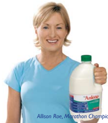
Allison Roe, Marathon Champion.

*Based on Anlene and independent trials.