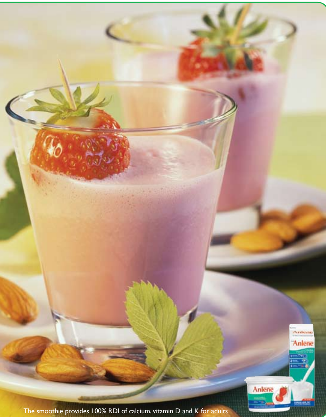
The smoothie provides 100% RDI of calcium, vitamin D and K for adults

Just two serves of Anlene* a day provides 100% of the recommended daily intake of calcium, vitamin D and vitamin K for adults, as well as magnesium and zinc. All of which are needed for maintaining strong, healthy bones. So next time you're in the supermarket, grab some Anlene, and try our delicious, nutritious fruit smoothie recipe.